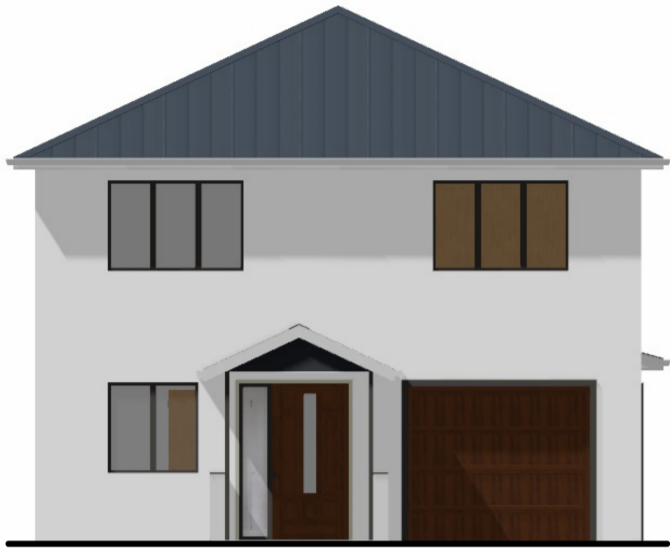
Front Elevation (north-east)