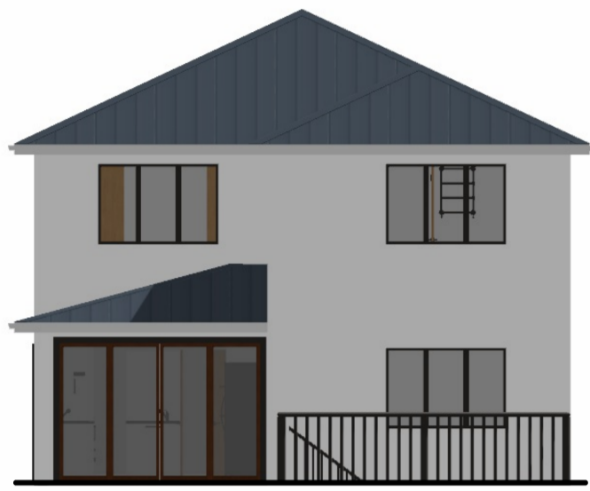
Rear Elevation (south-west)