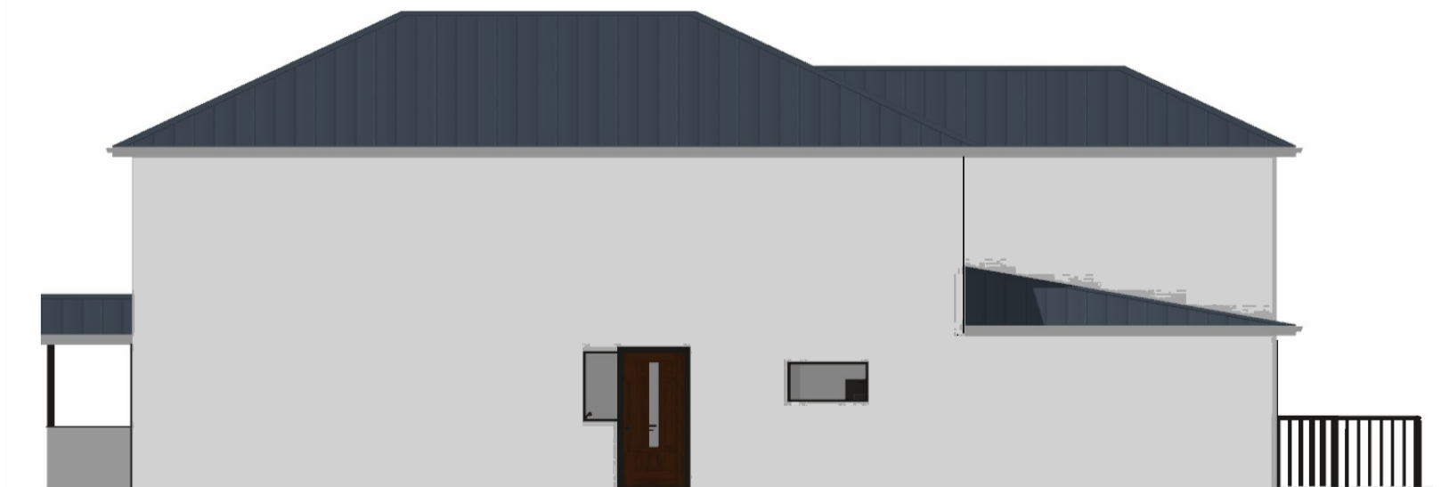
Side Elevation (north-west)